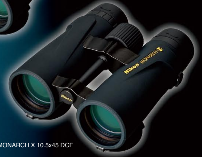
MONARCH X 10.5x45 DCF