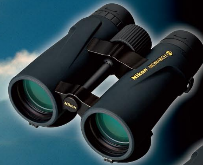
MONARCH X 8.5x45 DCF